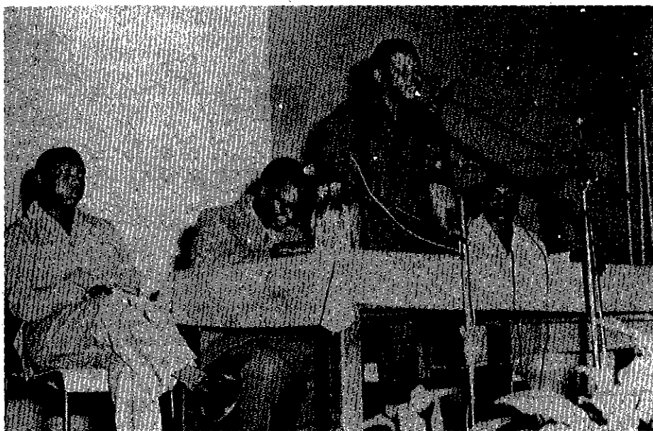
ANC exiles in Mozambique

and demoralised in the face of an onslaught of police repression, and the pass burning demonstrations had now turned into queues for reference books. At this point of downturn, the ANC called hopelessly for a general strike, a call the workers were by now incapable of meeting.