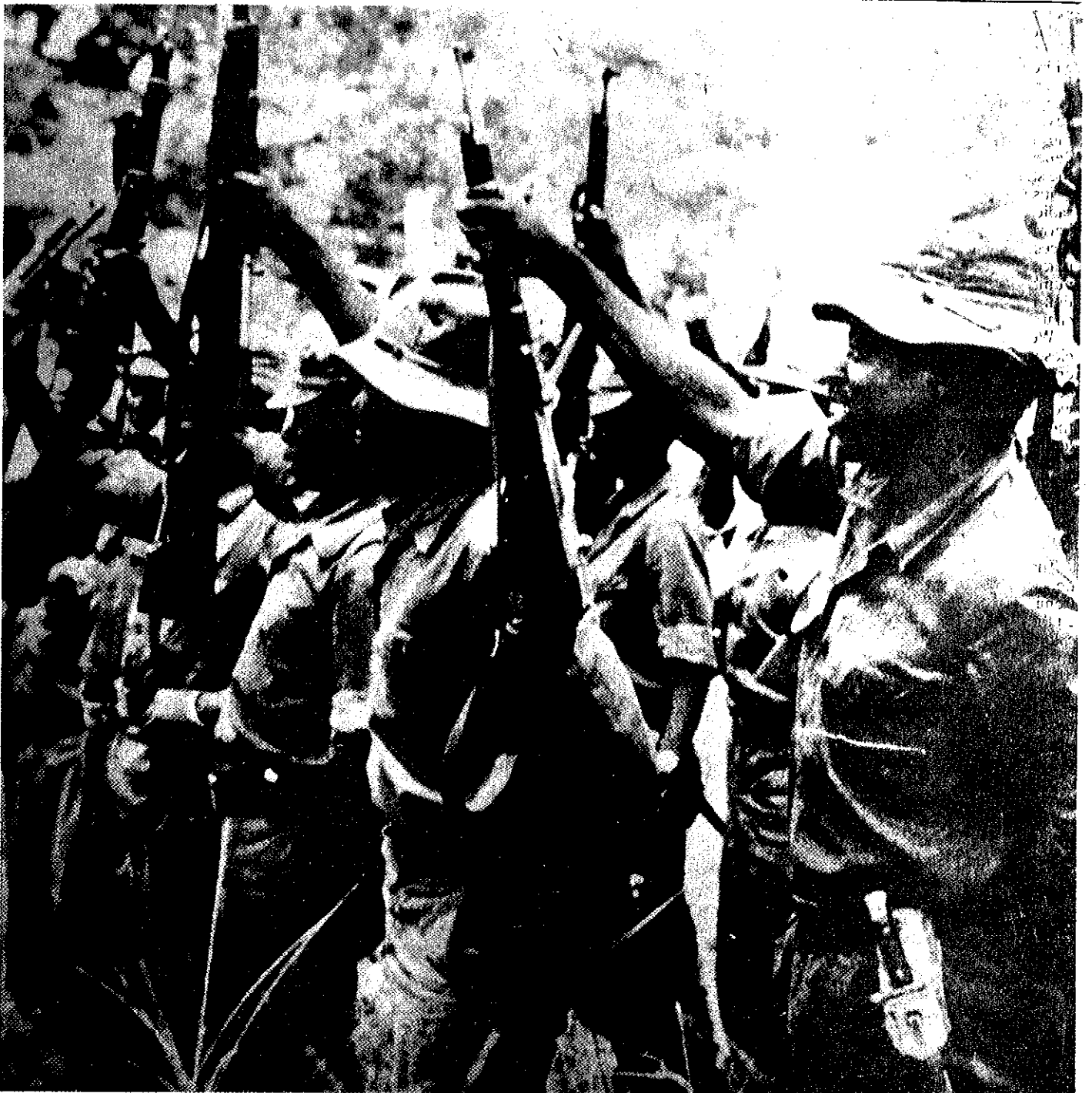
Umkhonto We Sizwe fighters