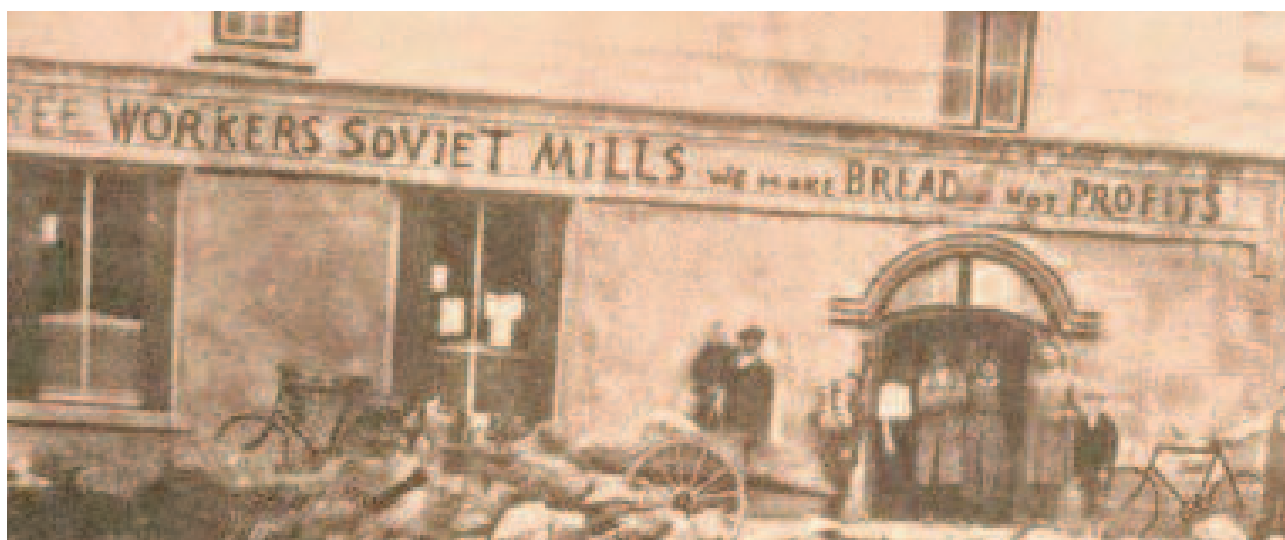
During the soviet period

The remaining example of rank and file working-class initiative to oppose imperialism is the subject of this pamphlet.