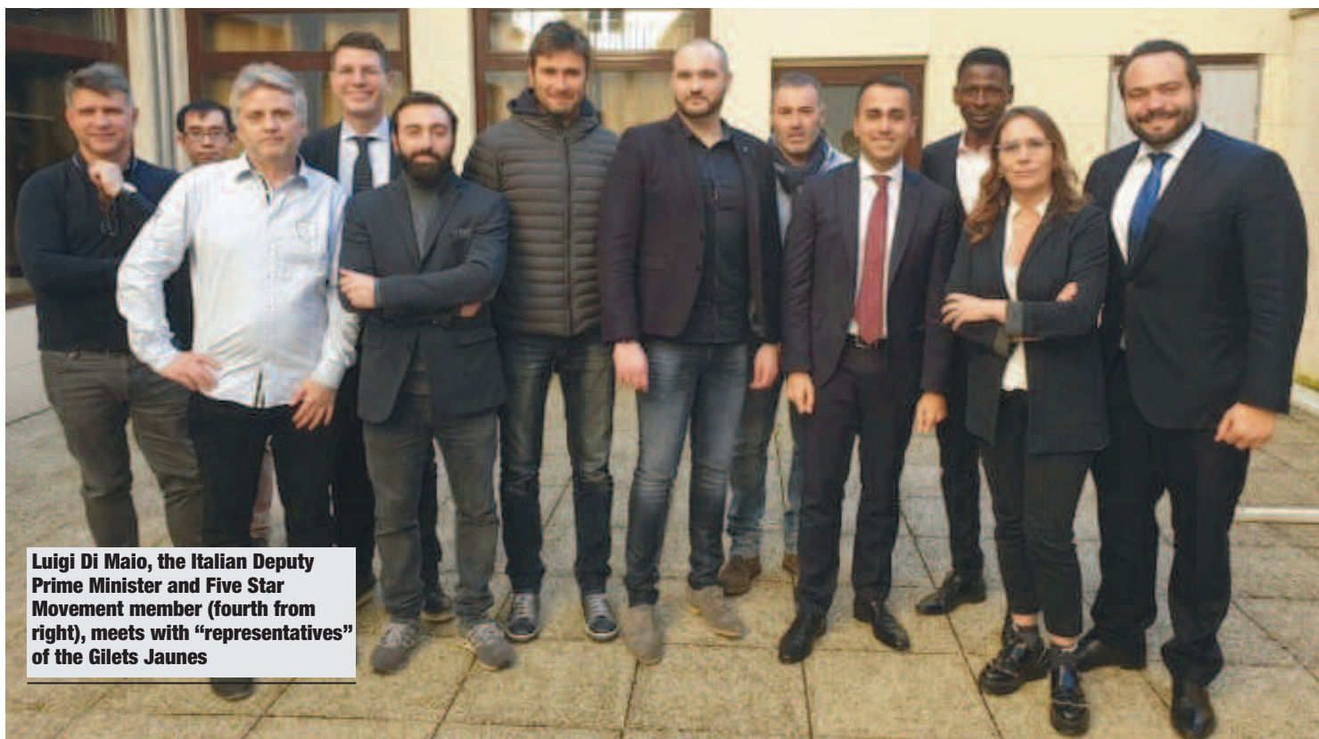
Luigi Di Maio, the Italian Deputy Prime Minister and Five Star Movement member (fourth from right), meets with "representatives" of the Gilets Jaunes

Athéné Nyctalope point out that a major difference between M5S and the Gilets Jaunes is the lack of a charismatic leader holding everything together. Things in France are more "diffuse and volatile" than that. But Sonia, writing for lignes-de-cretes.org , raises an important point about the political implications of the "decentralised" structure of the Gilets