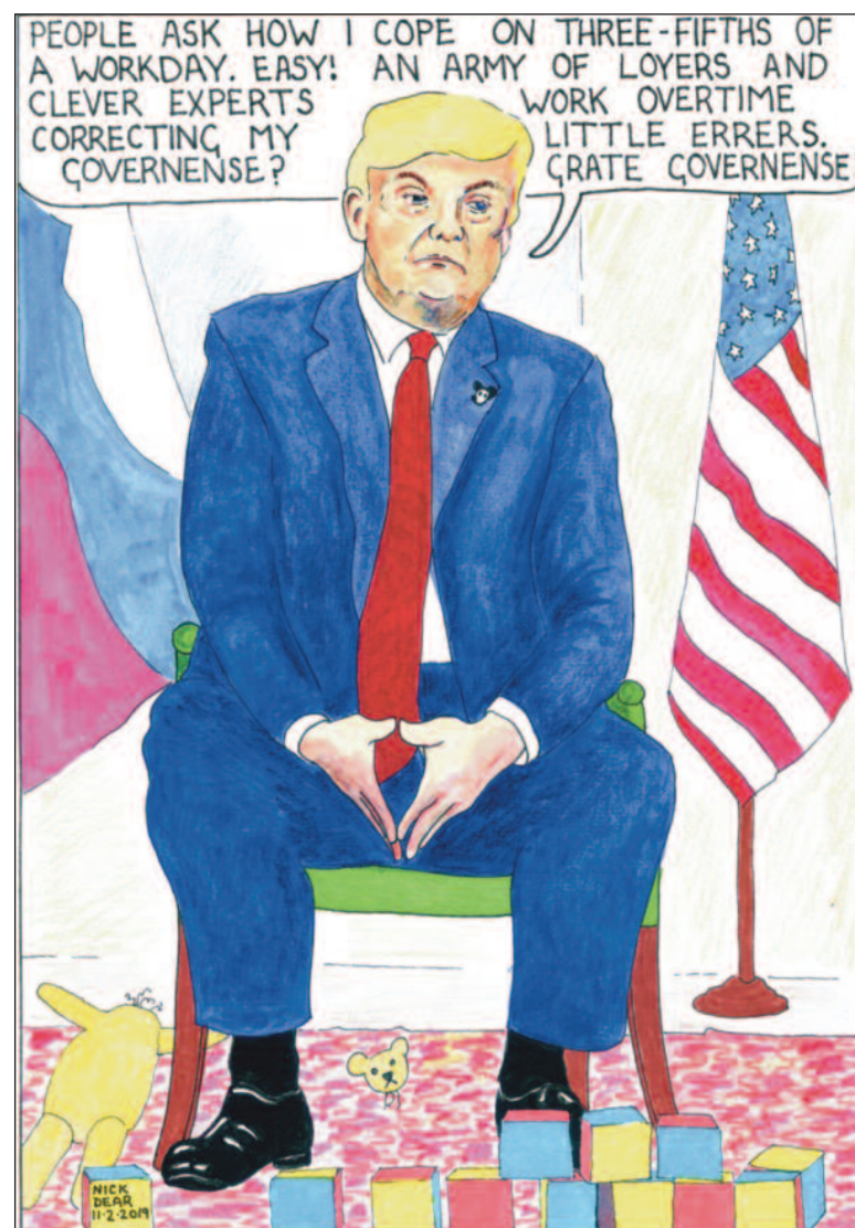
The White House officially reports that 60% of Trump's nominal work day is "executive time," when he tweets, watches TV, etc.

There is a political emergency too: the need for the left to find ways to dig into and win over sections of the plebeian layer of that right-wing base.