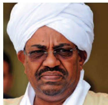
Bashir: Just fall – that’s all

Since the coup in 1989 Bashir has ruled over a repressive Islamist